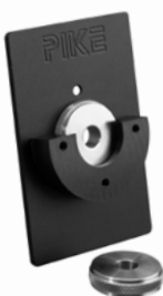
Single Pellet Holder