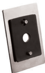
Magnetic Film/Pellet Holder