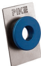
Heavy-Duty Magnetic Film Holder