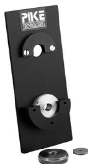
Dual Pellet Holder