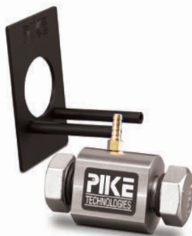
Bolt Press and Gas Cell Holders

The Universal Sample Holders feature a spring-loaded mechanism which conveniently keeps in place films, salt plates, KBr pellets and other materials. The clear aperture of the holders is 20 mm and 10 mm. This universal holder offers great sample mounting flexibility.