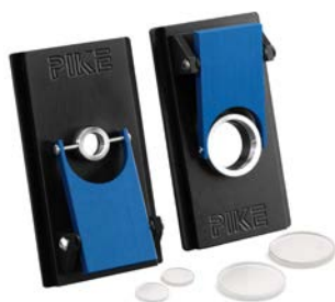
Universal Sample Holder

All PIKE Technologies transmission holders are constructed of high-quality materials and feature a 2" x 3" standard slide mount compatible with all FTIR spectrometers.